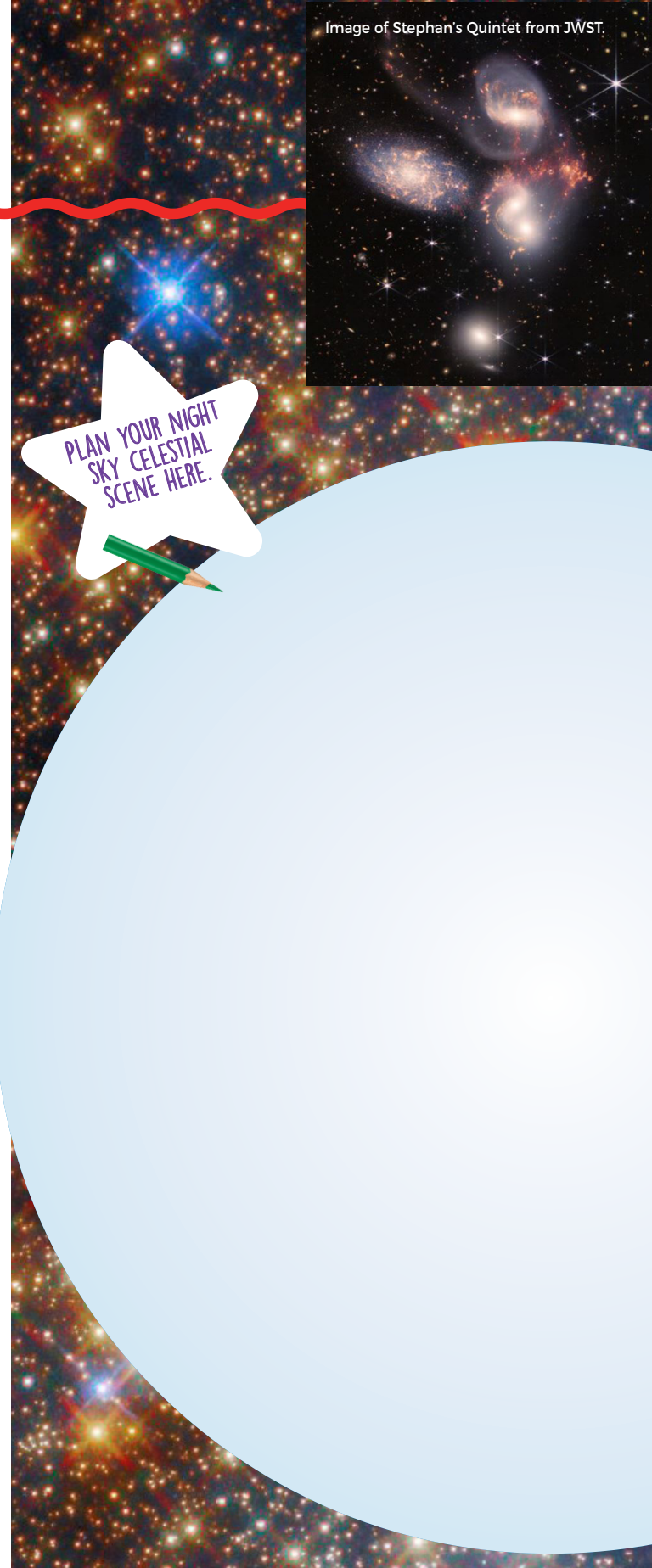
NASA's Hubble Space Telescope sees glittering globular cluster embedded inside our Milky Way.